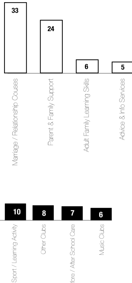
CHART 2. Percentage of Churches in England Undertaking Parenting & Couples Support Activities

“The benefits of improved engagement with faith communities are considerable.”